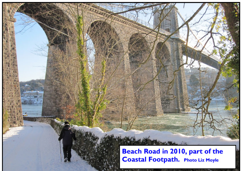
Beach Road in 2010, part of the Coastal Footpath.